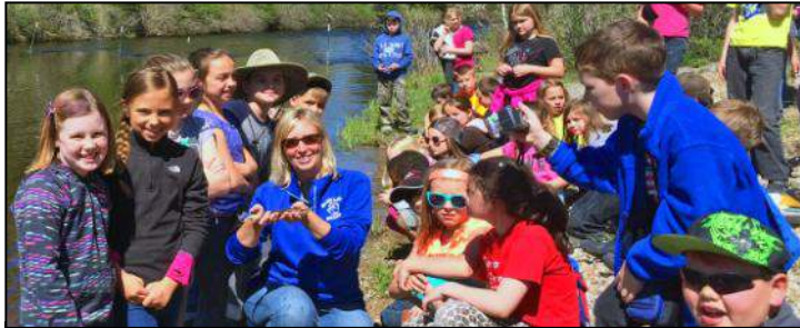
Students and teacher from Inland Lakes Schools release “Ace II” May 19, 2016.

In 2013, Sturgeon For Tomorrow (SFT), accepted responsibility as a “cooperator” for Sturgeon In The Classroom (SITC) and has been coordinating this statewide K-12 classroom program including individual classroom education plans. The St. Clair-Detroit River Chapter of Sturgeon For Tomorrow (SCDR-SFT) has also participated in the program by delivering sturgeon to the participating classrooms and serving as a source for support to the classrooms.