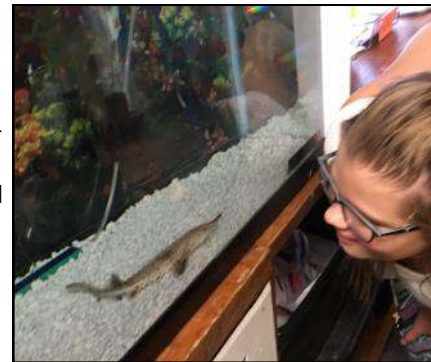
Students at Ella White School in Alpena observe their sturgeon on October 19, 2016.