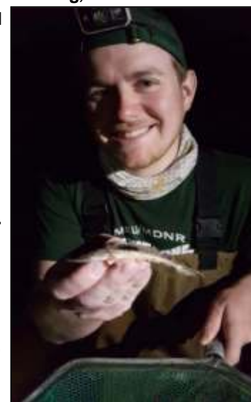
Juvenile sturgeon captured during fall survey.

Research efforts in 2016 focused on factors contributing to reproductive success; particularly those that can be quantified by data collected from Radio Frequency Identification (RFID) antennas placed throughout the Upper Black River. In addition, researchers continue to investigate the downstream passage of juvenile Lake Sturgeon through hydroelectric facilities. The research crew also began a pilot investigation into the downstream collection of wild-captured juvenile lake sturgeon. Smaller projects included measuring the effect of aquatic macroinvertebrates on Lake Sturgeon eggs and free embryos; predation of lake sturgeon eggs and free embryos by Rainbow Darter ( Etheostoma caeruleum , Storer, 1845); the selective properties of female lake sturgeon ovarian fluid; and the effect of biotic and abiotic factors on the quality of male Lake Sturgeon sperm.