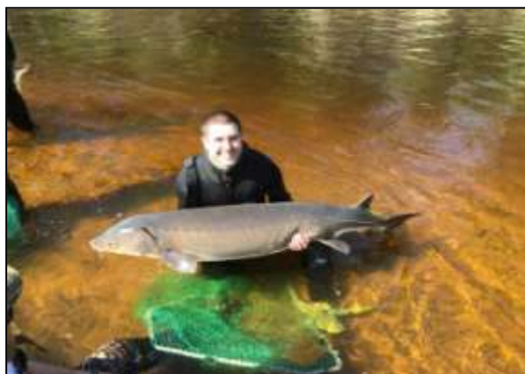
Largest fish captured in 2017 by weight. 6'4"; 151 lbs

In addition to raising eggs in the hatchery, wild larval Lake Sturgeon were captured as they drifted downstream. Previous research conducted by MSU and MDNR found that wild larvae represent the highest quality genetic source stock, so MSU and MDNR make an effort to fulfill all stocking quotas with fish captured in the wild, where possible. This year, larval drift sampling began on May 17th and continued until the crew could no longer get into the river due to rain. We did a follow-up sampling on June 28th, finding that the larval drift period had ended. In total, researchers captured 19,135 wild dispersing larvae, the most captured in a single season.